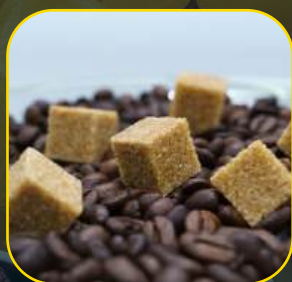
Herbal Tea Coffee Cubes