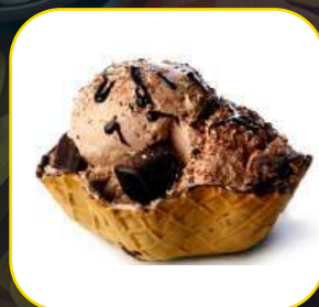
Ice cream Premixes